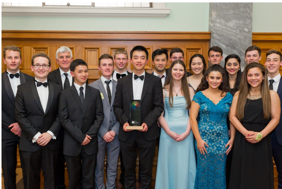
2016 Eureka Finalists at the Awards Dinner