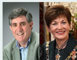
Sir Paul Callaghan and the Rt Hon Dame Patsy Reddy

2017 is the first year in which we will award a special prize for a special teacher who imparts the importance of passionate communication about the value of STEM to New Zealand.